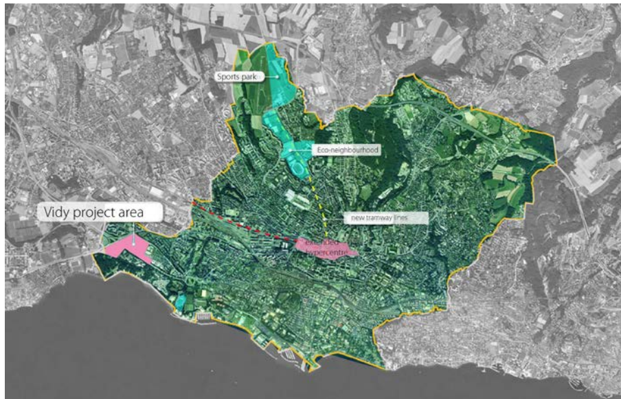
Figure 5. The Vidy strategic sector for the Métamorphose plan

Both sides require deeper thoughts about what kind of commerce should be attracted in the new development.