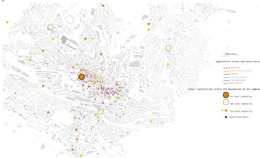
Figure 2. Retail centralities at Lausanne's commune scale, polarized in the hypercenter

Lausanne's historic center is poorly adapted to motorized mobility because of its abrupt topography, and has also properly working retail centers in the peri-central districts that are structured surrounding its highly commercial driven hypercentre (see figure 2). Still, like many other European cities, car-based mobility has been boosted which along with the peri-urbanization have changed consumers' behaviors so that proximity and neighborhood based pedestrian shopping has strongly decreased. However, the political context of this middle size city (Agenda 21, Green Party in the City Council) makes sustainable urban planning a key issue and it is nowadays in the agenda of Lausanne's decision takers to encourage urban walkability (Metasanté, 2011) and to avoid as much as possible the conversion of farming and crop areas into built environment (LAT 1979, PdCv 2008).