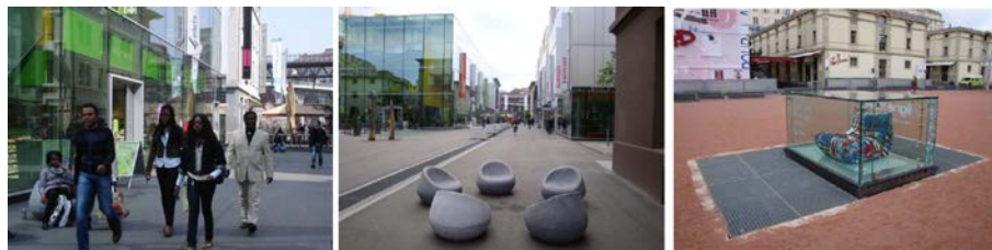
Figure 4. The Flon's main promenade a week day, public benches and street art combined in this retail driven urban project

VIDY Since 2007, Lausanne's municipality is putting into practice the Métamorphose plan, to accompany the growth of the city (Français, 2007). This plan is made of multiple project areas that are strategic for the city's development. These targeted project areas are well defined: a north sector with an eco-neighborhood and a southern sector Près-de-Vidy where a stadium and a mixed used oriented development will be set. According to Métamorphose , the Vidy sector's vocation is to become an entrance to the city (see figure 1) and like the Flon was, it is a site where neighboring urban tissues are of great diversity (the social high rise housing Bourdonette , the lakeside walkabout, the highway and the EPFL and Unil universities) making it a project challenge to give a legible image for Vidy and to link it to surroundings.