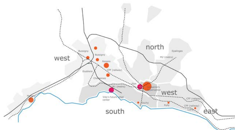
Figure 1. Retail centers gathering around the highway junction in the Western communes at the conurbation scale.

Regarding the conurbation's west "communes", before 2000 there was, according to Bieler from the SDOL bureau (2012) a rush to cope with the attractiveness of having the first multiplex shopping center. There was a wave of car-driven retail centers, and from this period dated what was later called the "Arc-en-Ciel" sector surrounding by the A1 cross one of the black points of the Confederation highway system. The Canton decided to impose a moratorium to all western communes: all urban projects would be stopped until they came up with a mutualized vision regarding developments that were generating more car flux and thus, air pollutants. This led to a convention document, which was not under any regulation the SDOL (Developing Scheme of Western Lausanne). The SDOL is a product of a conciliation frame: the communes that subscribe it could withdraw at any time since it is not enforced by regulations but just a convention between neighboring communes. The vision proposed by the SDOL is generated around the main objective of stabilizing motorized traffic, thus controlling the location of potentially car-flux generators such as retail centers. The SDOL led later to the PALM (Project of conurbation Lausanne, Morges) that enlarged the convention of the SDOL to the north and east sectors of the conurbation. In short, the PALM project was a bottom up process, starting with agreements from the western communes and expanding to the entire conurbation.